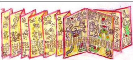
The Mayan Codices were painted on Fig Tree bark-paper.

The Maya also developed the most advanced writing system in the ancient Americas. Maya writing was made up of about 800 symbols, or glyphs . They used their writing system to record important historical events. They carved in stone or recorded events in a bark-paper book known as a codex . Three of these ancient books still survive. A famous Maya book called the Popul Vuh records a Maya story of the creation of the world.